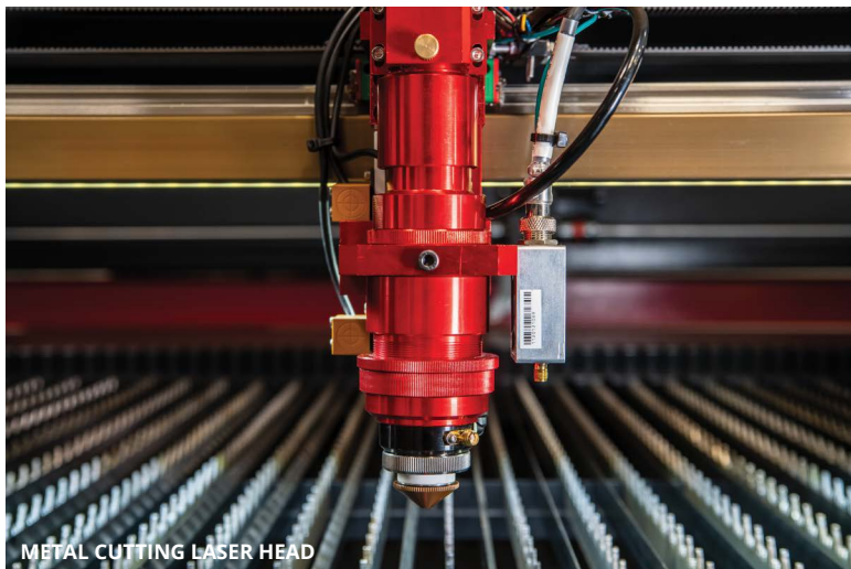
METAL CUTTING LASER HEAD